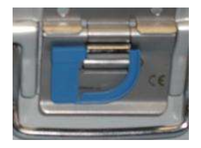
• Clean and Dirty Seal Pack