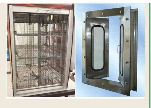
Fig. 2 -UV Disinfector placed at Pass through window

processing area. This notouch technology does not replace manual cleaning, but supplements it. The concept is to pass the manually cleaned devices from the decontamination side to the clean side through an ultraviolet (UV) disinfection system that is placed in the pass through window (Fig. 2). This way, the manually cleaned devices are further disinfected before they