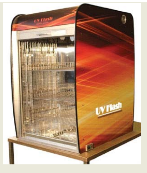
Fig. 5 - UV Flash Disinfector provided by Midbrook Medical, Jackson, MI

The study demonstrated that the manually cleaned devices did have a higher