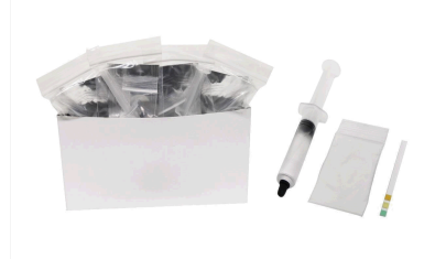
ChannelCheck™ Convenience Pack