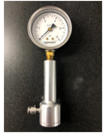
Fig. 2 Olympus Handheld LTT-1002