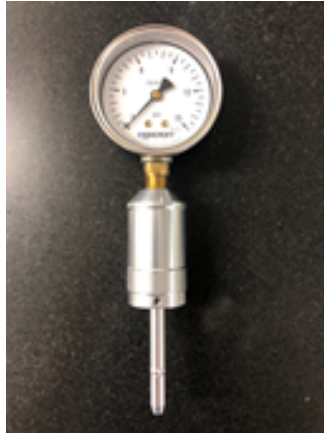
Fig. 1 Olympus MU-1 & ALT-Pro LTT-1001