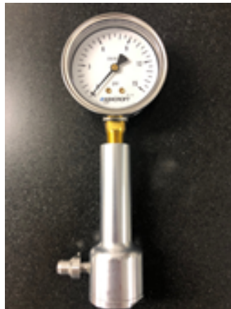
Fig. 3 Pentax Handheld LTT-1003