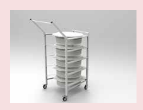
Transport Carts Page 4