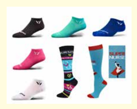
Compression Socks Page 6