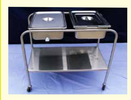
SST Accessories Page 4