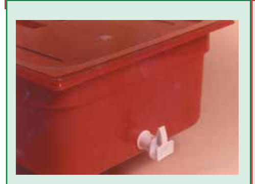
SST Accessories Page 4