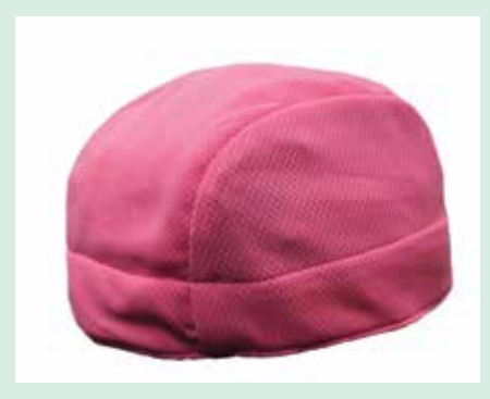
Cool Aids & Scrub Hats Page 7