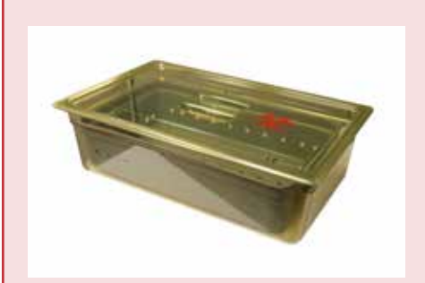
SST Tray Systems Page 2

A complete line of trays, carts, attire and accessories for the safe handling, retrieval, decontamination and sterilization of instruments and equipment