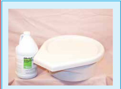
SST Tray Systems Page 3