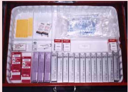
Crash Carts & Accessories Page 8