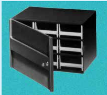
Key Locking Cabinets Page 5