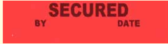
Tamper Evident Tape Page 4