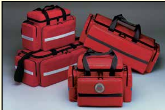
Soft-Sided Emergency Cases Page 7