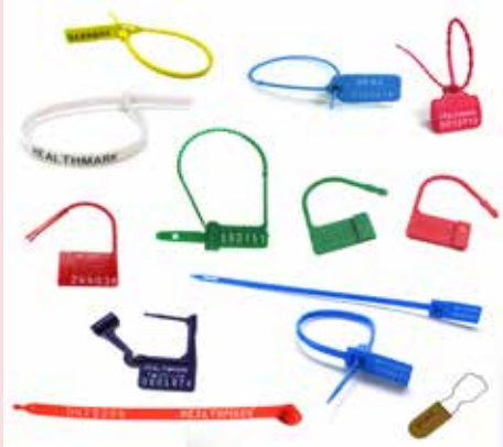
Tamper Evident Locks Page 2

A complete line of products for the security and use control of emergency supplies, equipment, pharmaceuticals and other items requiring tamper evidency and use-control