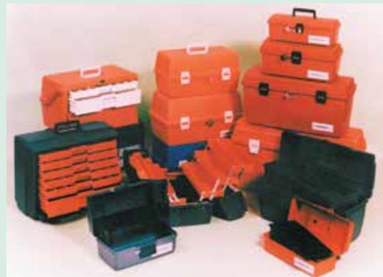
Hard-Sided Emergency Boxes Page 5